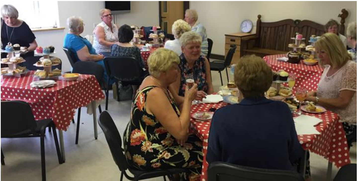
Photograph with volunteers enjoying afternoon tea at the Volunteer Thank You event in June