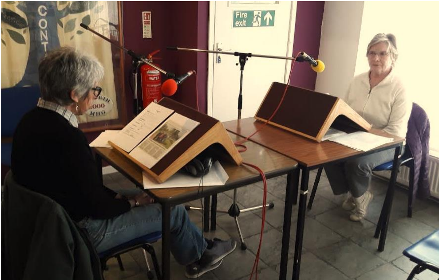
Picture with two volunteers at a table recording the Morpeth Talking Newspaper