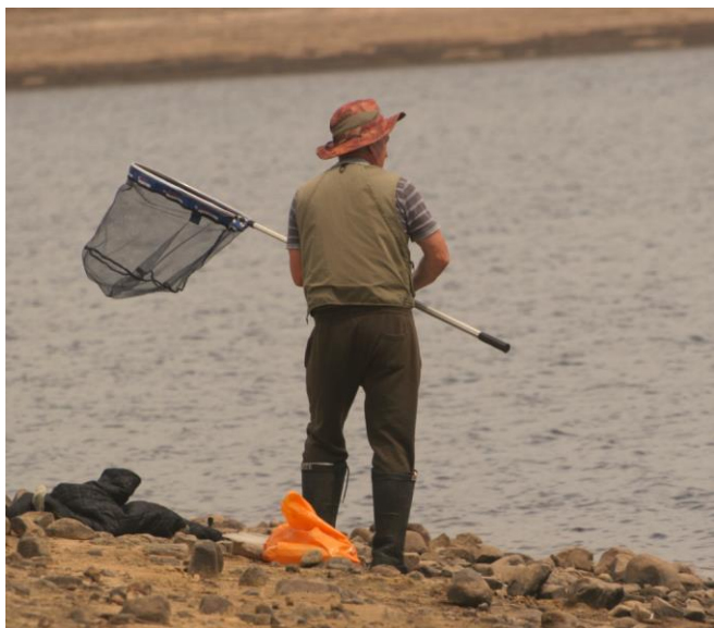
Picture of one of the competitors