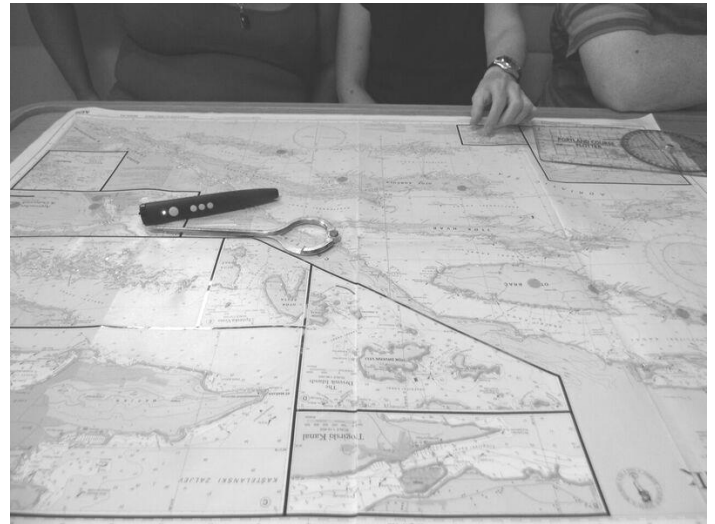
The photograph above shows a 'PENfriend2' on a map